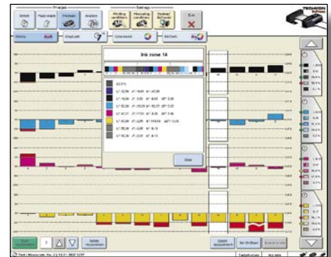
Complete information at a glance!