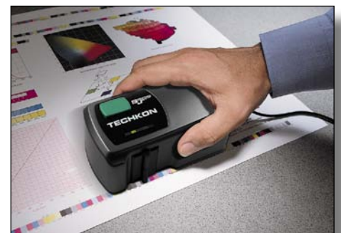
Works with any color bar!