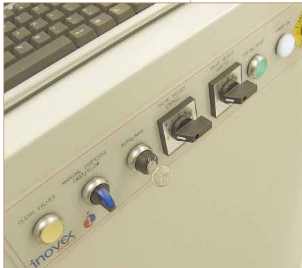
Manual control backup ensures uninterrupted production