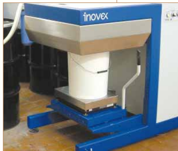
Scale slide assists in manual additions & removal of pail