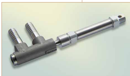
Full recirculation stainless steel dispensing valves